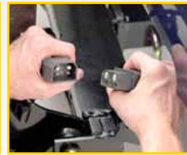
Step 3: Connect/disconnect power plug