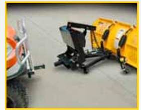
Step 4: Roll the plow away