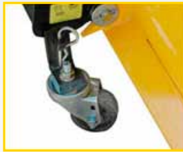
Step 2: Position the wheels