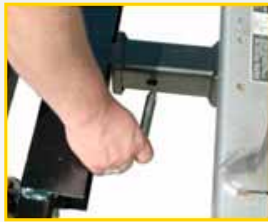
Step 1: Insert or remove the pin

comes on/off the vehicle in seconds by removing one pin.